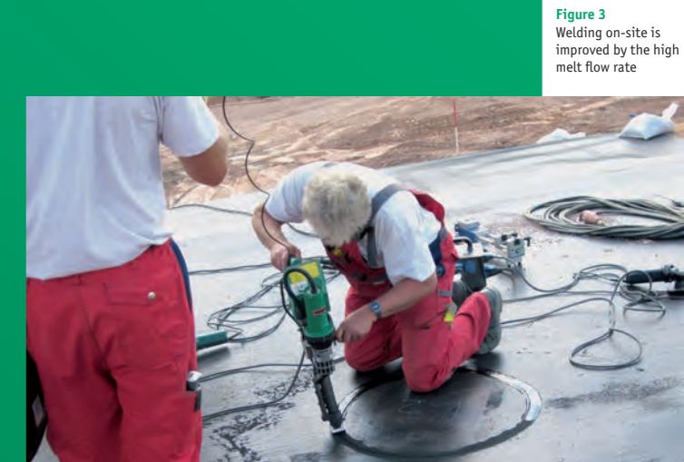
Figure 3 Welding on-site is improved by the high melt flow rate